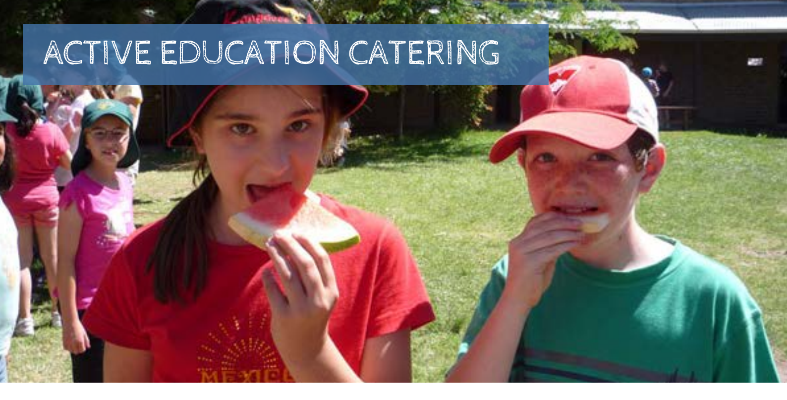
We believe the kitchen is the heart of any camp and dish out plenty of freshly prepared food at mealtimes